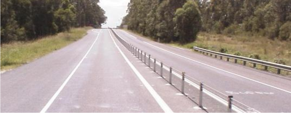
barrier despite trees and other hazards