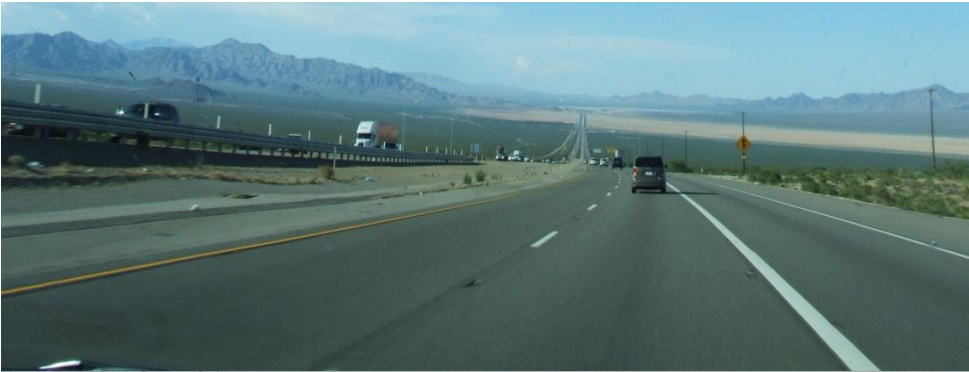
Figure 2: Examples of unsafe road engineering, where solutions are readily identifiable