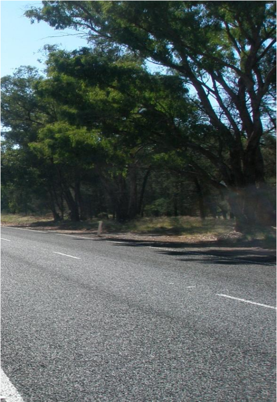
(b) Unprotected trees alongside a major high speed highway in Australia