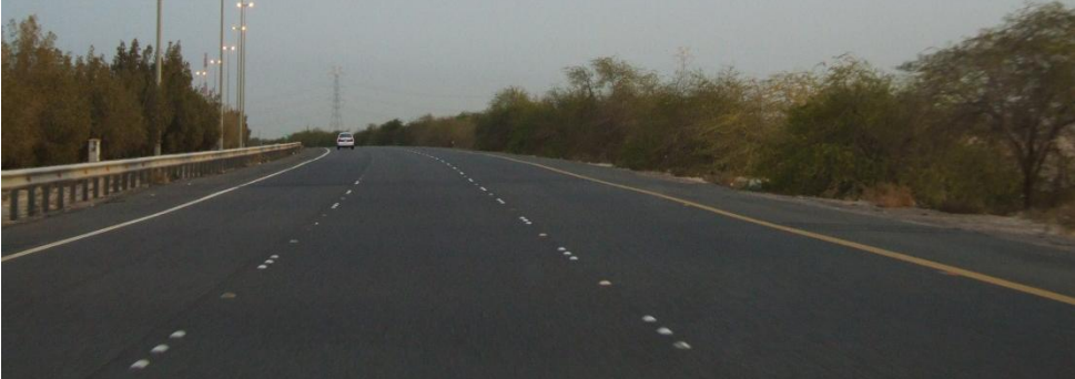
(b) High speed rural highway in a Gulf Region country, with median barrier but no shoulder