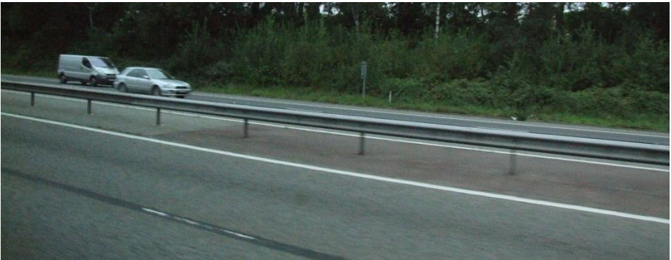
(d) High speed motorway (M1) in the UK, with median barrier but no shoulder barrier despite trees and other hazards