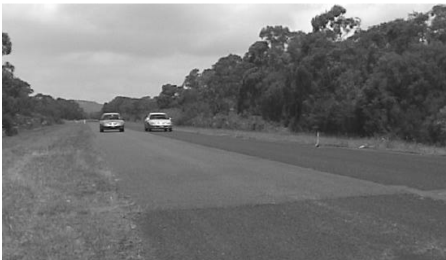
Figure 1. Still image of the arrival-time film scene.

Video recordings of scenes were conducted at the Holden Proving Ground at Lang Lang Victoria. A Sony Digital Video Camera on a tripod was directed down a straight section of road (the "noise road") at drivers eye height, and was positioned immediately to the left of the road. Filming of each approach commenced when the stimulus vehicles (one silver and one gold Holden VX Commodore) were 200m away from the camera. In each trial the two vehicles were travelling at different speeds and three combinations of speed were recorded, 44 and 72km/h, 58 and 72km/h, and 58 and 86km/h. The two vehicles were co-ordinated so that one of the two vehicles would pass a target line (a line on the road adjacent to the camera position resulting from a grading change in the road surface), 5-8m ahead of the other. The finishing order was counterbalanced between the faster and slower vehicle and across lanes. The arrival-time scene is illustrated in Figure 1.