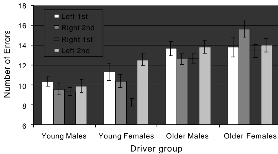
Figure 3. Bias measures for the four driver groups in the three speed conditions.

Figure 3 illustrates that older male drivers have a conservative response pattern compared to the other drivers. The fastest speed condition produced the least conservative response for all driver groups except for young females and a reliable difference between the speed conditions was found, F(2,88) = 6.60, p = .002 . A different pattern of response across the three speeds can be seen for the older groups (and in particular older females) compared to the younger drivers. This interaction between speed and age was found to be significant, F(2,88) = 4.422, p = .015 . Tests of between-subjects effects found a significant effect of age group, F(1,44) = 16.620, p < .001 , and a significant interaction between age group and sex, F(1,44) = 11.550, p = .001 . These results largely reflect the difference in bias for the older male group demonstrating a tendency to respond in a more conservative manner.