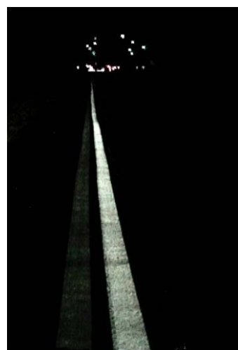
Right: The same two lines viewed on a wet night.

The far left line is a 'conventional' marking, with small sized glass beads to AS 2009-2002 Class B, measuring 350mcd/lux/m 2 . The line next to it has large sized glass beads applied to it, to AS2009-2002 Class D, and measures 450mcd/lux/m 2 .