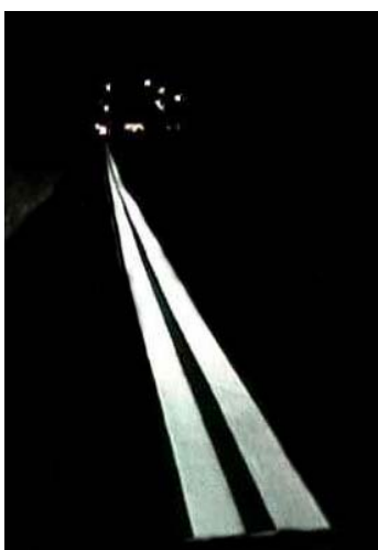
Left: Two lines viewed on a dry night.

Research as far back as twenty years ago has demonstrated the benefits for older drivers by providing wider and brighter road markings. In an experiment conducted in the US in Morris County and some other Counties in New Jersey, in the 1980’s, the edgelines were marked at 200mm wide. Over a three year study period, where wider edgeleines were used, the fatality and serious injury rates were reduced by 10%.