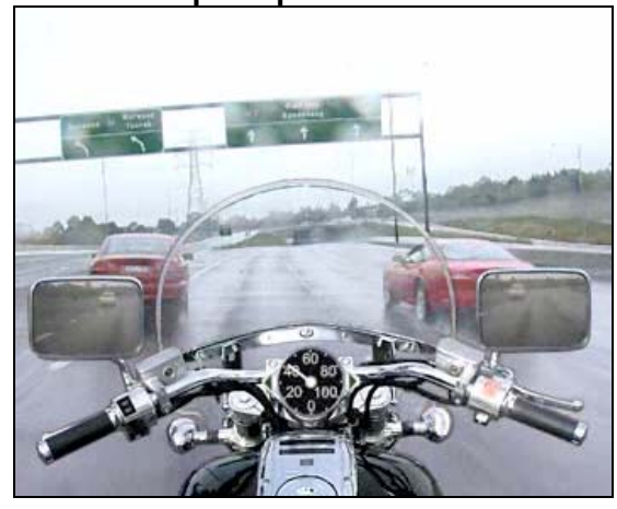
Figure 3. Interface B used for lane positioning exercises

Figure 2. Interface A used for scanning & hazard perception exercises