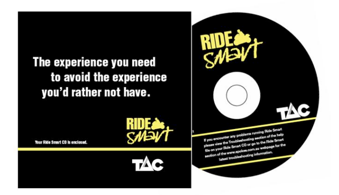
Figure 5. Ride Smart CD-ROM packaging

Concepts for the various marketing elements of the program, including order forms and packaging, were developed by an agency and market tested to refine. Figure 5 is an example of the look and feel of the CD-ROM packaging.