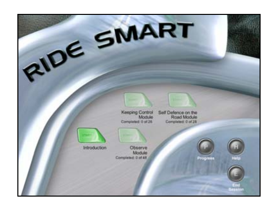
Figure 4. Image of the Ride Smart main menu screen

The general structure of an exercise, consists of the user viewing a video clip, and he or she making an observation or decision about what is seen. This is followed by feedback about the scenario and the potential consequences of making particular decisions. In total, Ride Smart takes approximately five hours to complete – which is encouraged to be done over several sessions.