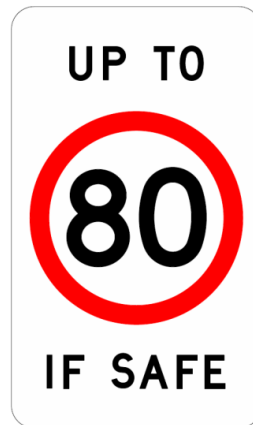
Figure 2 – An illustration of a possible speed zone sign reinforcing Safe System principles