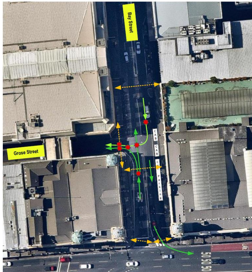
Figure 3. Example conflict diagram - Bay and Grose Street Intersection

Several potential conflict points have been identified, which are indicated in red in Figure 3. Some conflicts may lead to more severe consequences than others, with the most significant being vehicles turning into Grose Street, impacting with a crossing pedestrian.