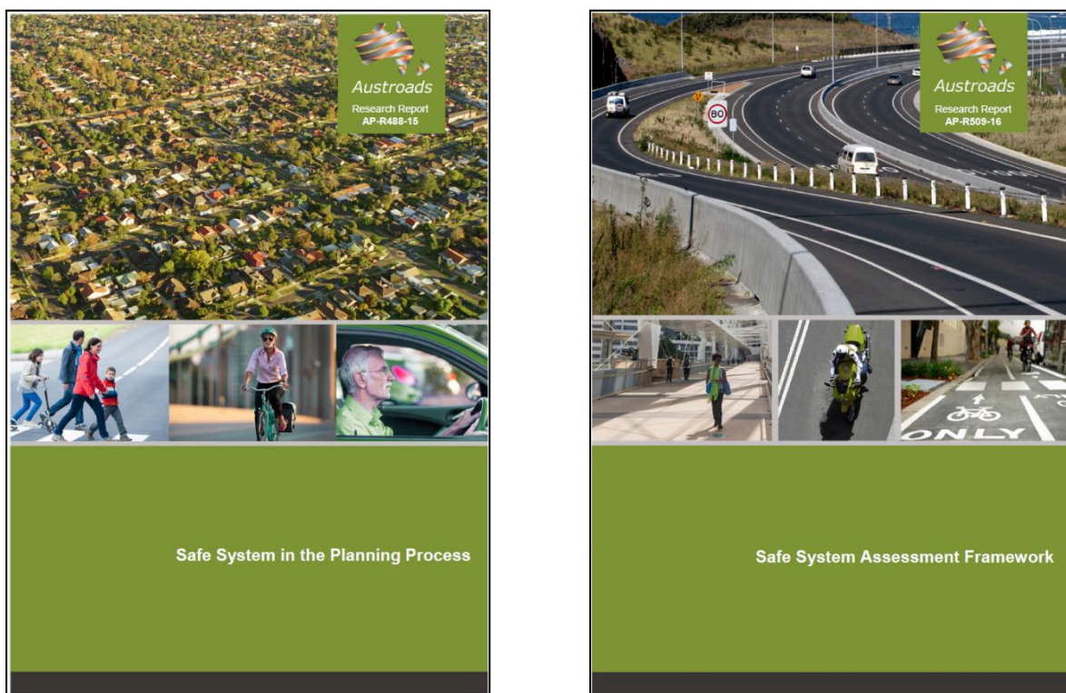
Figure 2. Companion Austroads Project Reports

The Safe System Hierarchy of Control Framework is complemented by, and complements, other practitioner tools and advisory guides prepared by ARRB Group for Austroads. Of particular relevance to local government are the research reports Safe System in the Planning Process (Austroads 2015) and Safe System Assessment Framework (Austroads 2016b), see Figure 2. Each provides local government planners and engineers with guidance about the applying the Safe System approach to their areas of managing council road and traffic infrastructure. Of particular note is the Safe System Assessment Framework , which provides a formulaic approach to assessing the level of Safe System compliance of potential treatment measures.