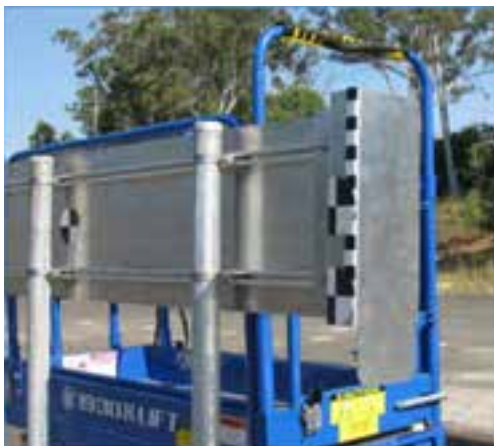
Figure 3. Test 2 - sign end reinforcement