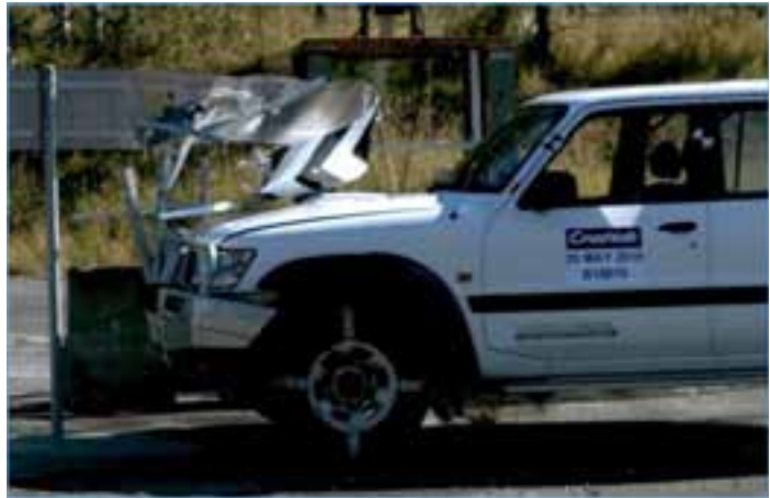
Figure 5. Test 3 – left - cut rails & stainless rope tether, right- successful crash deflection crash

The future research direction adopted was that the sign end must be prevented from impacting the windscreen. It was thought that some minor impact was tolerable as long as the sign face had been turned by approximately 90° which would present a large flat impact area to the windscreen and there would be no large concentrated inertial forces.