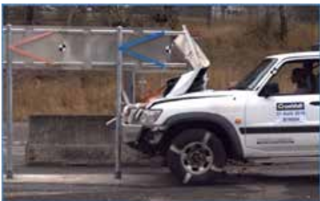
Figure 6. Test 4 - cut rails & flat straps

Test 4 (tethered with flat strap & cut rails) — The sign face for this test was significantly larger (6 x 0.6m) hence 65NB posts were used — refer to Figure 6. In this test, the tethered design was refined by replacing the 5mm wire rope with 40mm x 3mm steel flat straps to simplify the field installation. As the sign was comprised of four separate