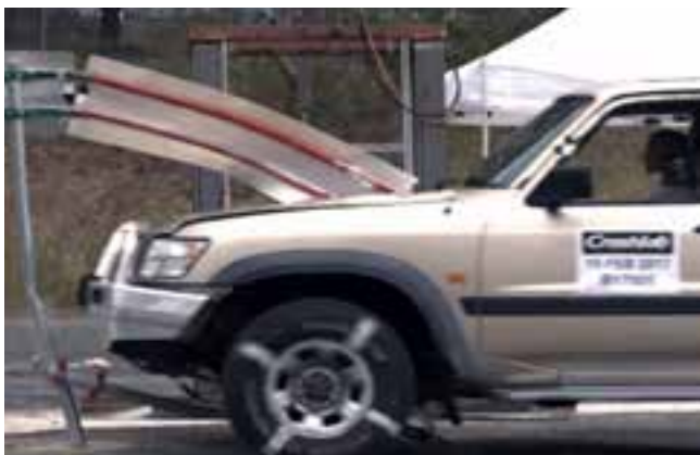
Figure 12. Test 8 – No through bolts and slicing of the bonnet