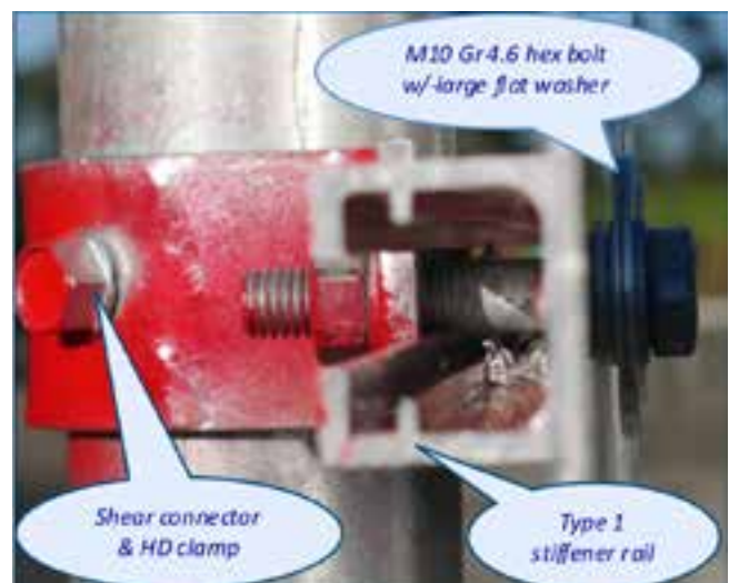
Figure 7. Test 5 onward – heavy duty clamps used

The clamp was fastened to the post with two self-drilling 14g x 20 screws which would act as shear restraints to