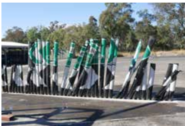
Figure 16. Testing of flexible signs