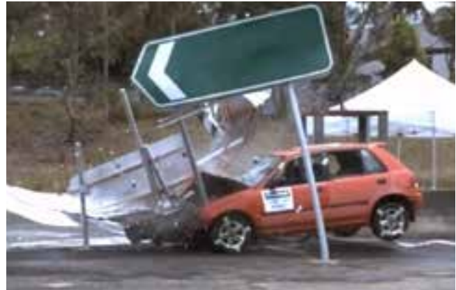
Figure 11. Test 7 – left-small vehicle on impact, right- large area signs & large posts

clamps could not generate enough force to prevent sliding along the stiffener rail. When a large axial and transverse force was applied to the cup head bolts, the channel shaped aluminum stiffener rail bent open allowing the bolt heads to escape. During the initial pull-down, the bottom edge of the sign face had sliced through the vehicle bonnet.