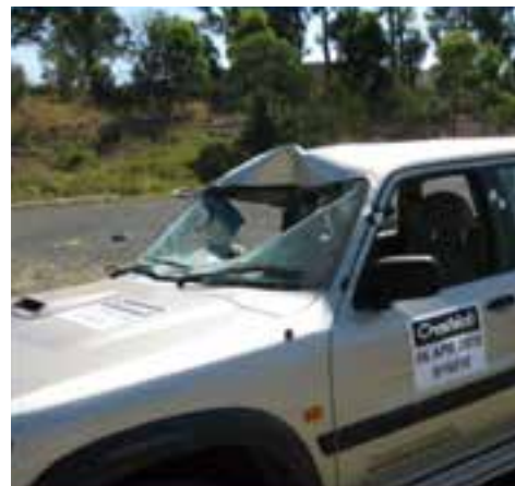
Figure 4. Test 2 - significant vehicle damage