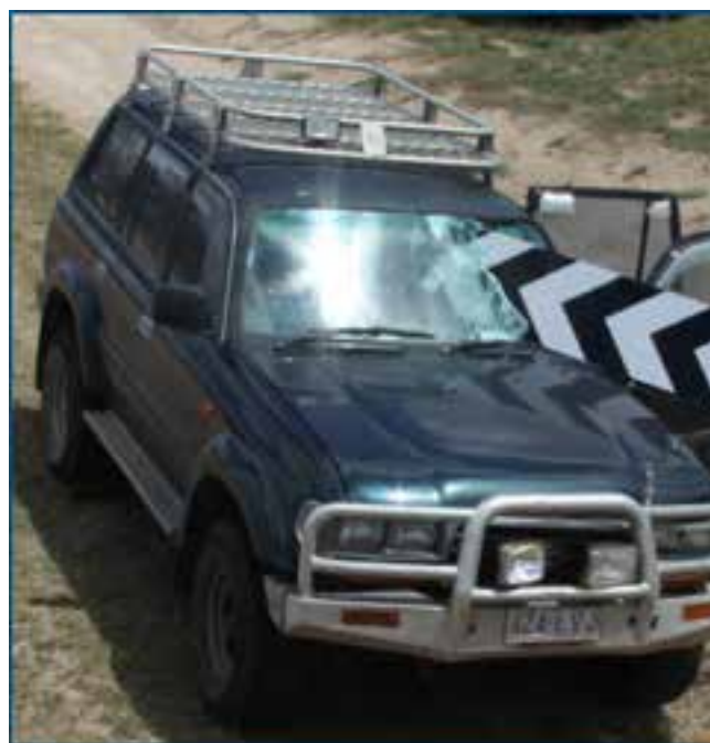
Figure 1. Sign spearing incident

The danger associated with end-on crashed with road signs has only recently come to the attention of road agencies. While these road traffic signs are frangible, their end-on