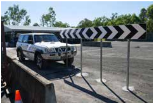
Figure 2. Test 1 – sign layout & vehicle damage after crash

The encapsulating plate added strength to the front of the sign which resulted in more damage to the vehicle roofline above the windscreen — refer to Figure 4. After Test 1 and 2, it was thought that the inertial forces were so significant that a windscreen could not develop enough resistance to deflect a sign over the vehicle. Even with the sign end having a special energy absorbing treatment and the impact area increased, windscreen damage was likely. When a crash occurs and the first post is bent out of the way, the remaining posts downstream hold the sign horizontally and provide restraining forces. Hence if a windscreen were to deflect a sign, it must overcome the sign's high inertial forces and the horizontal and vertical restraining forces provided by the intact posts.