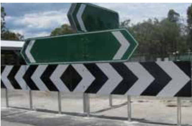
Figure 10. Test 7 – large sign structures

A component of the test was to witness the effect on a small car with crashing into larger diameter posts (65NB & 80NB) – refer to Figure 11. Heavy duty anchored clamps