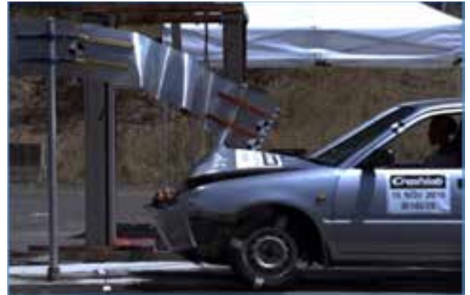
Figure 9. Test 6 - Shortened rails & HD anchored clamps

were employed as per Tests 5 & 6. The design exception was that the longitudinal stiffener rails were not cut. Despite considerable vehicle damage the test was a success.