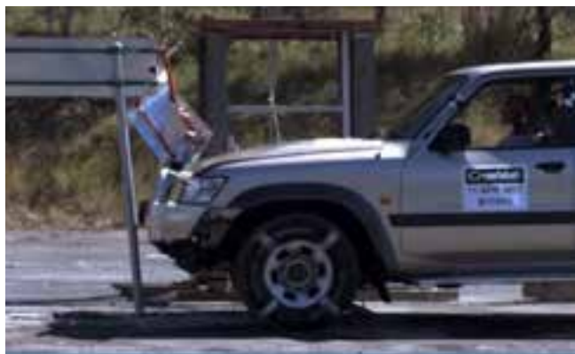
Figure 14. Test 9 – successful pull down