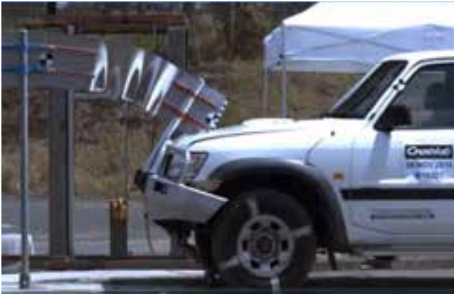
Figure 8. Test 5 - Shortened rails & HD anchored clamps

prevent longitudinal sliding. The cutting of the aluminum stiffener rails process was improved by lubricating the cutting blade with lanolin liquid lubricant.