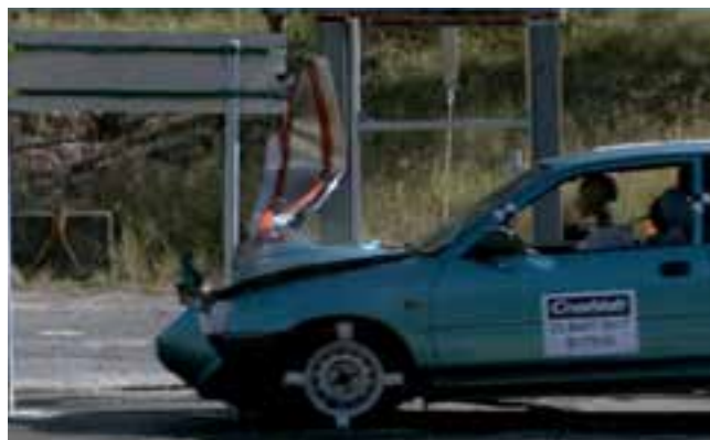
Figure 15. Test 10 – successful use of HD clamps & bolted through design

resistance to the colliding object and thereby causing virtually no impact force to be imparted on the vehicle and its occupants or riders. A commercially available product has been tested and was found to require complete replacement after one collision. While this protected the vehicle occupants, the installed sign was prohibitively expensive. Its application would not address the vast number of existing signs that require treatment. Therefore the replacement of traffic signs with flexible “plastic” signs is not considered as an alternative approach.