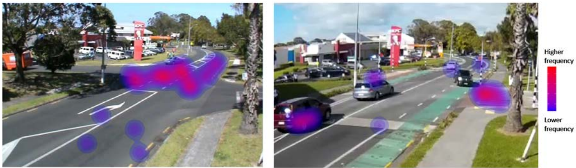
Figure 3. Location and frequency of pedestrian/ vehicle interactions at Site A pre- (left) and post-intervention (right)

For people on bikes, at Sites A and C, there was a shift towards use of the cycle facility, meaning there are proportionally fewer on the road (-19.2% Site A and -10% Site C), thereby reducing the potential for interactions between motor vehicles and people on bikes.