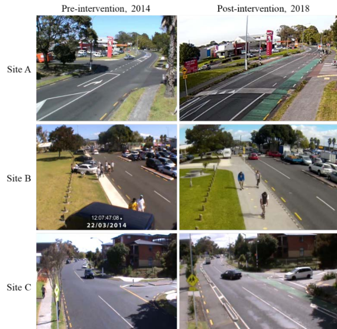
Figure 1. Video views of sites A, B, and C pre- and post-intervention

A coding framework (Figure 2) was devised to capture the behaviour of pedestrians and cyclists and to analyse their interactions with other road users (e.g. car, bus, van). The definitions of encounter types were adapted from Kraay (2013), Hunter et al (2012), and Johnson et al (2010). Two people coded the videos and an interrater exercise was conducted to ensure consistent agreement between the coders.