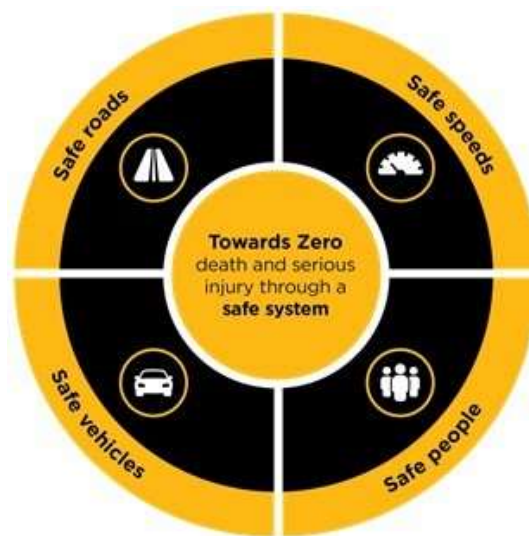
Figure 1: Safe Systems (Towards Zero) from NSW Road Safety Plan 2021. A new strategy is being developed.

New South Wales Centre for Road Safety is well into the task of devising Road Safety Plan 2026 which will succeed Road Safety Plan 2021 .