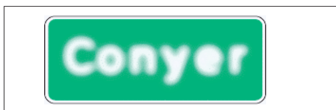
Figure 7. Example of irradiation [24]

It is also useful here to discuss the coding of VMS. Along the M1, VMS messages are presented in simple text, which Chatterjee and McDonald [12] have found to cause 'few problems with ... legibility and comprehensibility' (p.570). Further, M1 VMS messages are amber-coloured, which in another study [23] was found to be preferred over red or green. In addition, M1 VMS consist of no more than two frames, have no more than two lines of text per frame, and for single frame messages, do not flash. This design follows that set by the US Department of Transportation [25]. Regarding flashing, a study of drivers in a simulator by Dudek, Shrock, Ullman and Chrysler [26] found the following: