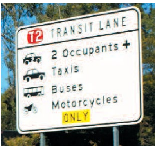
Figure 8. Multi-symbol sign on the M1

The M1 'Transit Lane' sign in Figure 8 shows excellent usage of symbols. This sign uses a combination of symbols and words to attract drivers' attention to the specific information that describes their situation. The vehicles are presented in their best view, which is side on, and the symbols face towards the text, thus creating pointers towards it. The symbols also provide redundancy in message delivery.