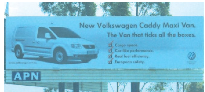
Figure 11. Billboard advertisement containing a large amount of information

Figure 11 presents an example of an M1 billboard that presents a large quantity of information. Using the SANRAL guidelines, it is questionable whether drivers would have time to safely read this sign since it contains 29 bits of information and a web address.