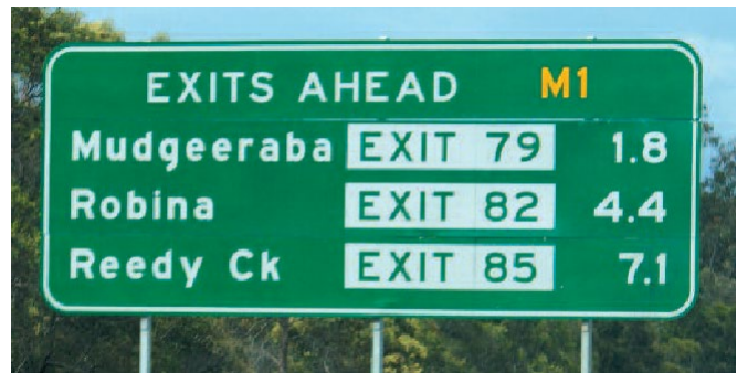
Figure 3. Example of a guide sign along the M1

Figure 3 shows a typical example of a guide sign along the M1, which follows the principle of spreading in that it stays within cognitive information processing limits by presenting a reasonable amount of information in a clear and easy-to-read format.