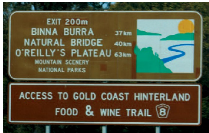
Figure 4. Tourist sign

Some tourist signs along the M1, however, appear to contain a great deal of information and in a smaller size of text, which would make them difficult to read in the short amount of time available. Figure 4 presents an example. This sign may be particularly difficult for older drivers to read.