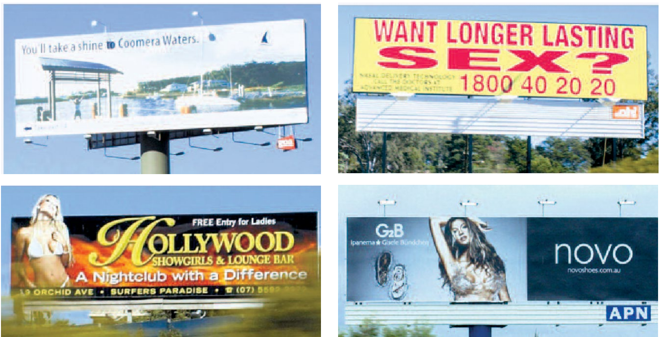
Figure 13. Potentially over-attractive signs