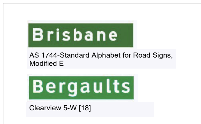
Figure 6. Comparison of Australian standard road sign font with Clearview font

The researchers reported a 16% increase in recognition distance for night driving. As stated earlier, since drivers generally use signs more at night than during the day and since older drivers may have reduced vision, it would probably be worth testing the Clearview font on road signage under Australian conditions. More than twenty US states have adopted Clearview [23].