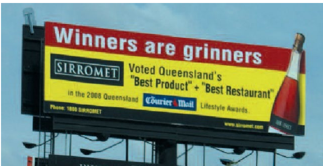
Figure 12. Sign with poor alignment

Figure 12 presents a billboard that could use better alignment of information to convey its message. It contains 20 bits of information, a phone number, a web page, and an additional message below the billboard. A more consistent layout would allow for easier scanning. It also contains white text in the heading.