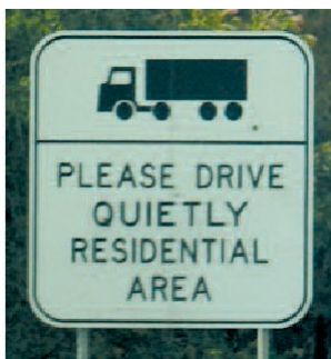
Figure 5. Sign printed in all uppercase letters

Although the experiment [22] showed no difference in legibility for place names that were presented in uppercase or mixed-case text, there may be a difference for longer phrases composed of more familiar words. Therefore, it may be valuable to test whether a sign such as that in Figure 5 would be read faster if presented in mixed case.