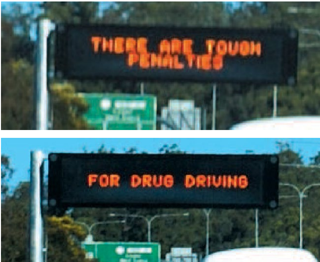
Figure 2. Example of a VMS along the M1

Along the M1 section under study, this research noted that the principle of primacy is sometimes violated for one type of sign, which is the VMS. Messages on these signs often contain public service or educational rather than traffic guidance information. Sometimes the signs are blank, but little traffic-related information is given because there is little need for it. Examples of VMS educational messages are 'Every k over is a killer', 'Keep left unless overtaking', 'Report traffic incidents call 13 19 40', 'Slow down stick to the left', and 'Police now targeting defective vehs'. Figure 2 presents an example of one of these signs along the M1.