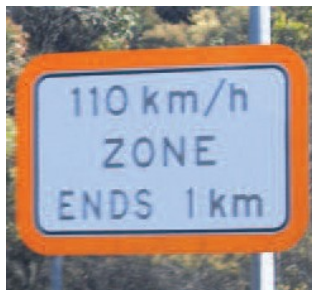
Figure 9. Sign designed to attract additional attention with fluorescent-orange border

Redundancy also occurs when the same message is provided on more than one sign. It is noteworthy that along the M1, merge, speed limit reduction and guide signs are presented in duplicate to assist drivers. For example, Figure 9 presents an example of an M1 speed limit reduction sign that is placed and visually designed to maximise attention. Copies of this sign are placed on both the left and right sides of the southbound M1 lanes, and following them are the speed limit signs. The sign also works to attract attention by using larger than usual text and a wide fluorescent-orange border.