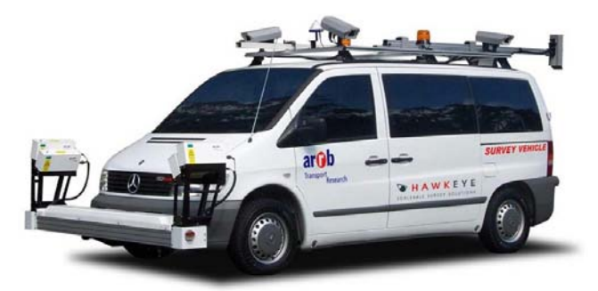
Figure 5. A network survey vehicle equipped with Hawkeye video cameras are mounted on the roof. The apparatus at the front of the van is a battery of laser sensors for measuring road surface characteristics.

roadsides using the Hawkeye video camera system. Road and shoulder cross-section, offset to roadside objects, and the presence of signs and road markings could all be determined from the video images and related to their exact location on the road map.