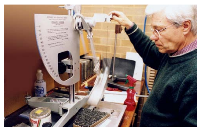
Figure 4. A British Pendulum Tester being calibrated in the laboratory. This was (and still is) used to measure skid resistance.

ARRB also contributed to road safety in other ways in this period. The journal Australian Road Research provided an outlet for Australian work. The biennial ARRB conference provided the only national forum for road builders and managers to catch up with developments in research and practice; this included strong representation from local government engineers. In addition, a series of two to three regional symposia per year brought new thinking and findings to practitioners in many areas outside the capital cities. ARRB's library services developed Australia's premier road transport library collection, maintained an index of all Australian work on roads and road transport, and prepared Australian material for input into international bibliographic databases.