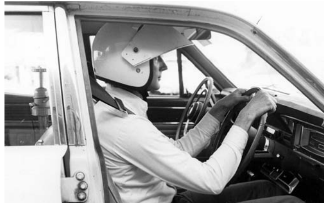
Figure 3. The 'snapping turtle' occluding helmet was used to test delineation treatments by periodically interrupting drivers' vision and seeing how well they could stay on path. Note the dual controls in the car – just in case!

prime mover and trailer; skid resistance management guidelines (Figure 4); roundabout design; and local area traffic management standards and guidelines.