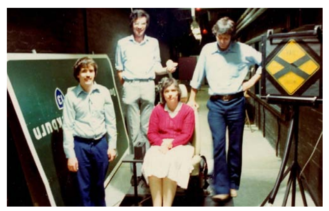
Figure 1. The ARRB dark tunnel – with the lights on! Can you identify the two people who are currently prominent in academic life?

chains and even stronger nerves were essential (Figure 2). Two generations of instrumented cars were used to test driver curve negotiation behaviour with different delineation treatments.