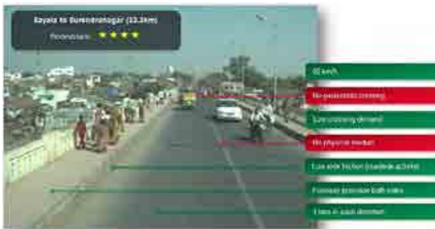
Figure 3c. Examples of roads and star ratings in Asia Pacific