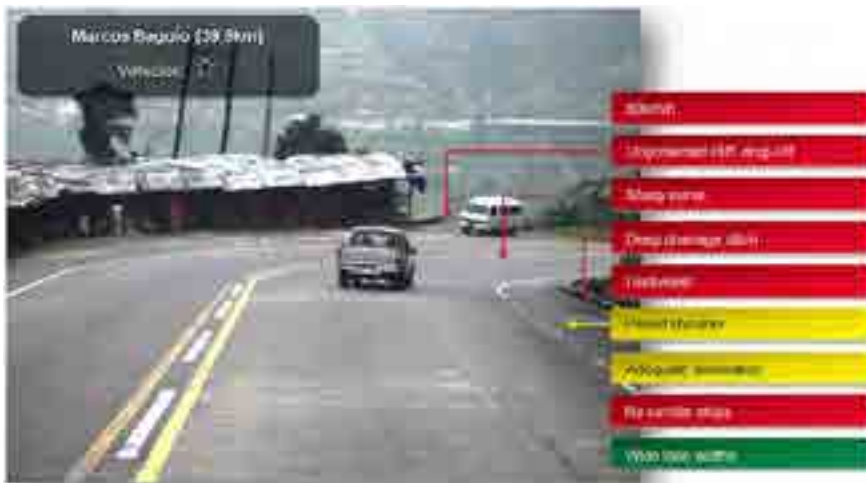
Figure 3b. Examples of roads and star ratings in Asia Pacific