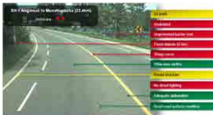
Figure 3d. Examples of roads and star ratings in Asia Pacific