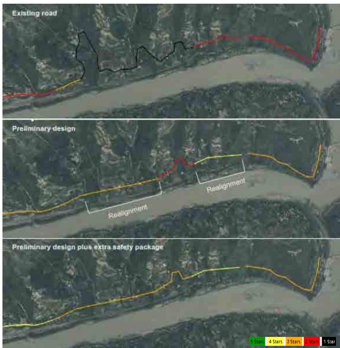
Figure 4. Targeted improvements to designs in Shaanxi, China