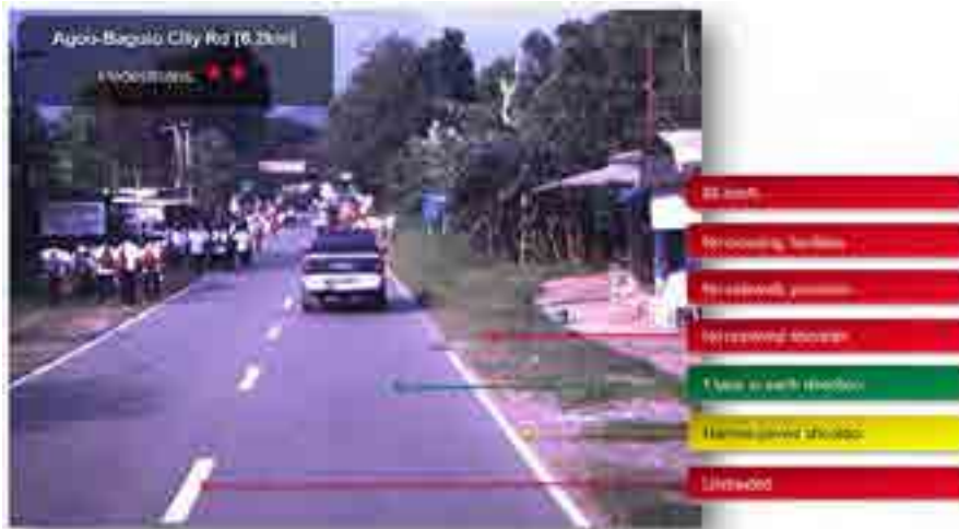
Figure 3a. Examples of roads and star ratings in Asia Pacific