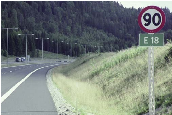
E18 Motorway showing widened centre reserve with no barrier, passively safe sign posts, passively safe lighting columns and gentle side slopes to retain traffic

However my view is that modern safe roads should be provided with wide verges with gentle slopes, wherever possible, to gradually redirect the errant vehicles gently back towards the carriageway. I am convinced, even where land is expensive, that providing wide central reserves and verges (with suitable attention to slopes and banks to guide errant vehicles) will be significantly safer, more cost effective and more aesthetically pleasing than providing and maintaining expensive barrier to a minimum width highway when the ongoing cost of accidents and injuries is properly accounted for. Barriers should of course be used where they are essential and there are no alternatives.