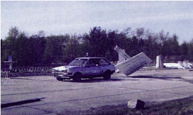
Sign and mast falling close to its original position after impact