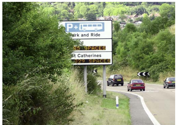
Personally I would be terrified hitting something like this (a heavy VMS sign on rigid steel posts either of which represent an unacceptable risk)