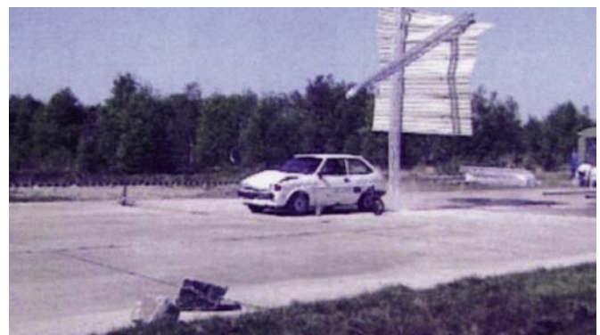
Why not reduce the topside weight as absolutely much as possible and go underneath like this.