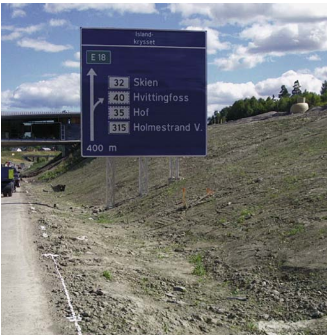
E 18 in construction

In Scandinavia, as the picture shows, on some new motorways like the E 18 and E 6 south of Oslo, even the normal central