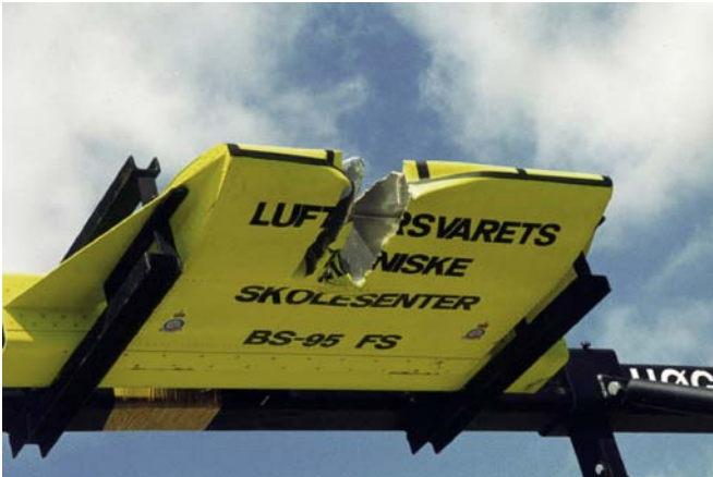
Damage to light aircraft wing after 120 kph impact

For example the use of HE and LE masts is often recommended: