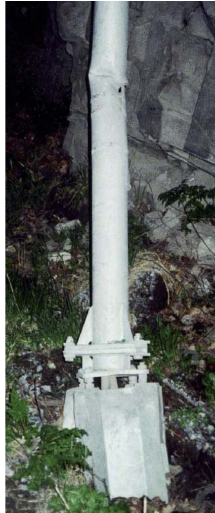
A steel slip based mast which has been hit at a high level. The heavy mast failed to shear off and it can be seen the mast has not bent or distorted significantly. This will have been a very hard impact.

It is recommended that energy absorbing sign masts and energy