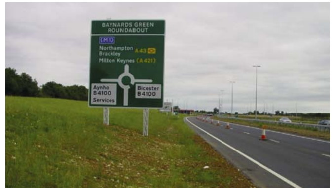
Forgiving Roadside, not only the future, but already here in the UK

The road minimises the use of barriers where possible, all signs are light in weight and sign support masts and lighting columns are passively safe (light in weight and yielding energy absorbing products and not slip based products)