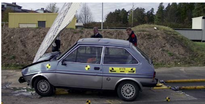
Picture shows a LE Sign Post trial in Sweden where the Sign wants to go above the car while the mast underneath..... Note This is not a standard Lattix mast, but one we attached permanently to the foundation so it does break free on impact

From the above tests we learnt that when designing for safety it is important to consider what object a signpost will carry. A heavy Variable Message Sign (VMS) will be a great danger to a vehicle hitting the sign and whether the posts were NE or LE will be irrelevant provided they are lightweight passively safe and yield or fail in the impact as designed. Height is also most important and a heavy object can penetrate a vehicle windscreen if the object is low or the vehicle windscreen high.