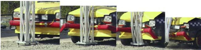
Obligatory EN 12767 low speed 4425 NE test (35 km/h = 21.0 miles/h).

Then there are true energy absorbing poles and masts which progressively deform in an impact. They are usually formed from thin walled aluminium tubes or tubes formed from rolling thin steel plates. Lighting columns are typical examples. The tubes deform or flatten on impact and thus absorb energy whether categorised as NE, LE or HE.