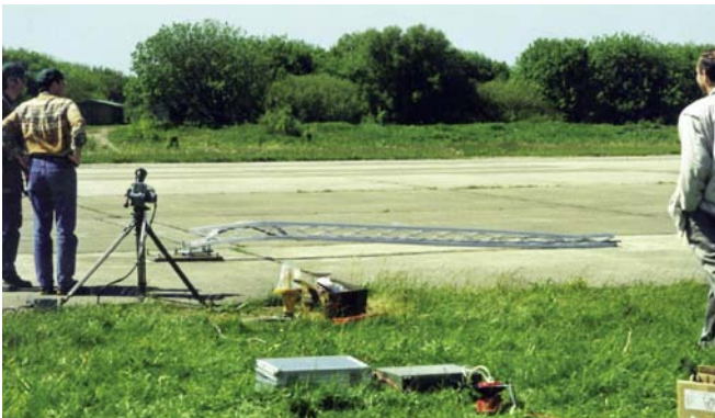
Lattix mast after 120 kph impact with aeroplane wing section

The answer is no. In my opinion an NE post tested at 100kph is suitable for use for all traffic speeds. The Scandinavian countries followed Table 7 – Hierarchy of Performance Types in EN 12767:2000. The table states a 100,NE,3 product includes approval to performance type 70,NE,3 and similarly a 100,NE,2 product includes approval to performance type 70,NE,2. Table 7 was drawn up to limit unnecessary testing. Table 7 may I understand be omitted from the forthcoming update to EN 12767. but in my view testing at 70 kph or 50 kph is still unnecessary and will not add to safety where an NE product is tested at 100kph and 35 kph. In Norway 100 NE approved masts, regardless of safety class, are used on all types of road in urban and country areas (although there are limitations on slip base products in urban areas).