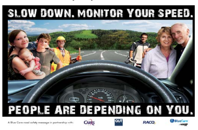
Figure 2. Road safety poster developed in-house

These posters were designed from the driver view of the road, reinforcing that, as drivers, people are depending on them (Figure 2). Other communication and dissemination strategies included stickers and driver safety handbooks and brochures. To ensure that all Blue Care staff, volunteers and their families receive the road safety message, over 20,000 copies of the road safety manual were printed and distributed. Copies were made available for visitors to pick up in Blue Care centres.