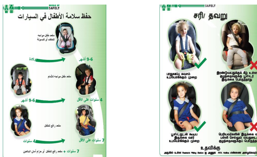
Figure 3 Translated versions of the Buckle-Up Safely posters

During the family session participants were informed of the limited offer of subsidised restraints (at a cost of $50) to parents of children attending the service. The appropriate restraint for their child was discussed with each parent. As not all families attended the information sessions a Buckle-Up Safely bag was distributed to all families whose children attended the service. More than 800 bags were distributed.