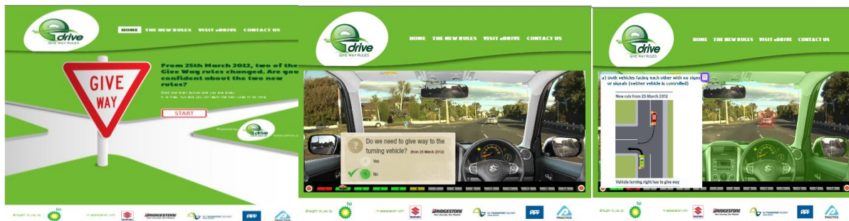
Figure 1. The give way programme website: home page (left), a ‘correct trial’ (middle) and an ‘incorrect trial’ feedback screen (right)