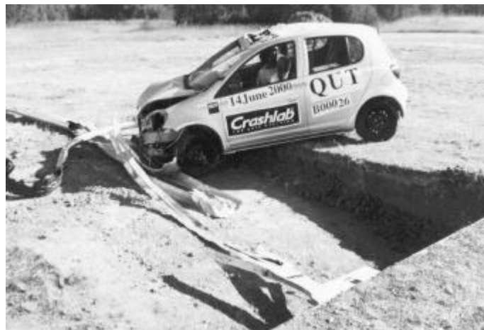
Figure 3 Final position of test vehicle

Crash footage demonstrated that the vehicle was unstable during the collision, primarily due to the influence of the verge arrangement. After the frangible portion of the pole had been deformed, the front of the vehicle snagged on the return grade, lifting the rear of the vehicle. An angle of approximately 60 degrees between the undercarriage and level ground resulted. Airbags were not activated by the collision. During the collision the outreach arm and luminaire broke free and landed in the position shown in Figure 2. The arresting properties of the pole were apparent with the vehicle coming to rest a short distance from the impact point. The post collision position of the vehicle is shown in Figure 3.