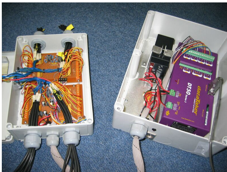
Figure 1: Input converter (left) and data logger (right)

Each bus involved in the AMS component of the trial was fitted with seat belts that had a switch built into each seat belt buckle to detect whether the belt was fastened. Cables were used to connect each buckle (two buckles per pair of seats) to the data logging equipment (Figure 1) at the rear of the bus. The input converter continually counted the number of seat belts that were fastened and represented the number in a form that could be recognised by the data logger. The data logger was designed to store the numbers provided by the input converter. The contents of the data logger's memory could then be downloaded to a computer for analysis.