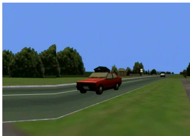
Figure 1: Stimulus traffic scenarios presented in the road-crossing simulation

Responses were made on a computer keyboard on the desk in front of participants. Most of the keys were blackened and covered. Two keys ('J' and 'D') labelled 'YES' and 'NO' respectively, were available for participants to indicate whether they would 'cross' the road or not. The keys for numbers 1 to 9 with labels 'very unsafe' below the 1 key and 'very safe' below the 9 key, provided a nominal rating scale on which participants were asked to rate the safety of the road-crossing.