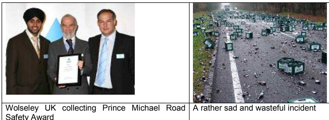
Figure 1 – Positive (safety award) and negative (lost product) fleet safety outcomes

As an example, organisations actively involved in initiatives such as the UK National Road Safety Week, organised by the road safety charity Brake, are mentioned in almost every local and national media outlet around the country. For only a small investment of time/funds this allows active participation in the local community and provides a great deal of good coverage for doing so.