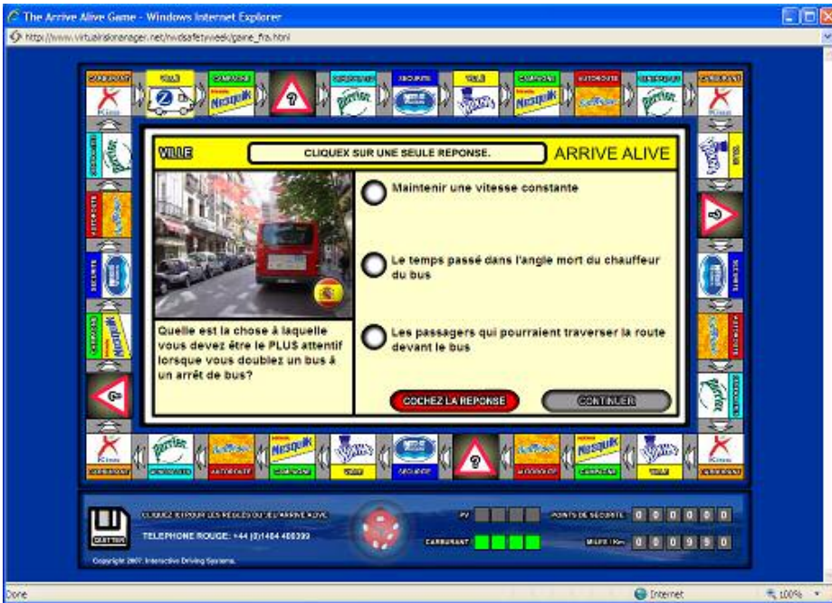
Figure 4 - Nestlé Waters Direct Road Safety Game

On all its KPIs, Nestlé Waters Direct has clearly made a significant difference to safety performance and costs.