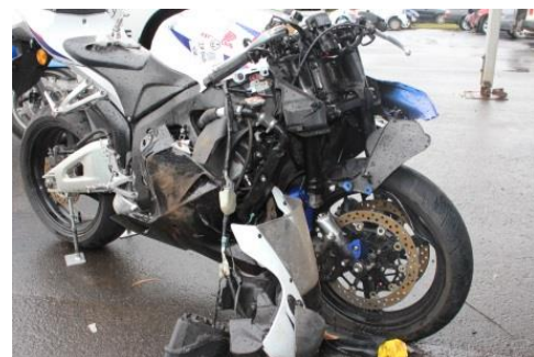
Figure 2: Example crash scenario (left) and photo of case motorcycle (right) used to assess the potential of AEB on crash likelihood or impact speed