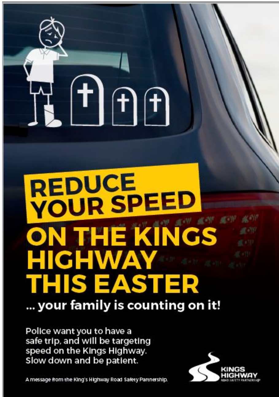
Figure 1. Reduce Your Speed Easter: Poster with police message.