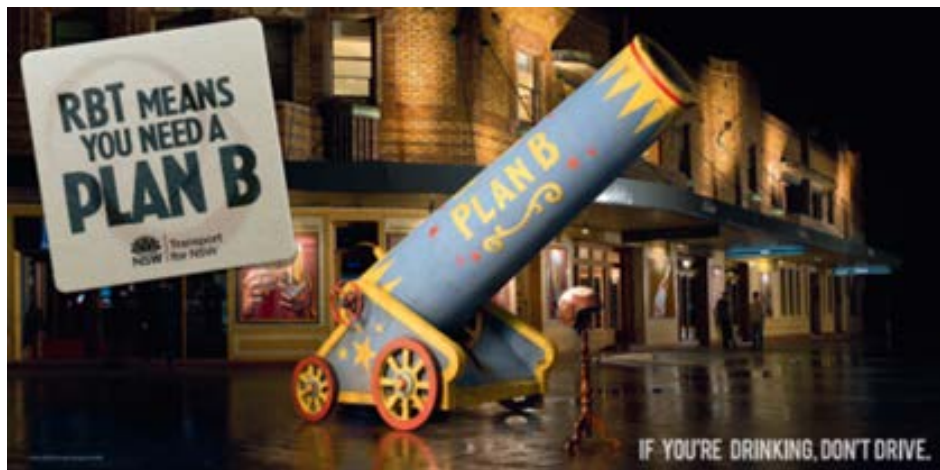
Figure 2. 'Plan B' campaign creative

However, in 2015, there was an increase in the number of lives lost on NSW roads which continued into 2016 and 2017. In 2018, the NSW Government launched the Road Safety Plan 2021 (the Plan) to reset its road safety priorities in line with its Towards Zero vision. Underpinning the Plan is the Safe System approach, which will guide the delivery of countermeasures to reduce death and injury on NSW roads.